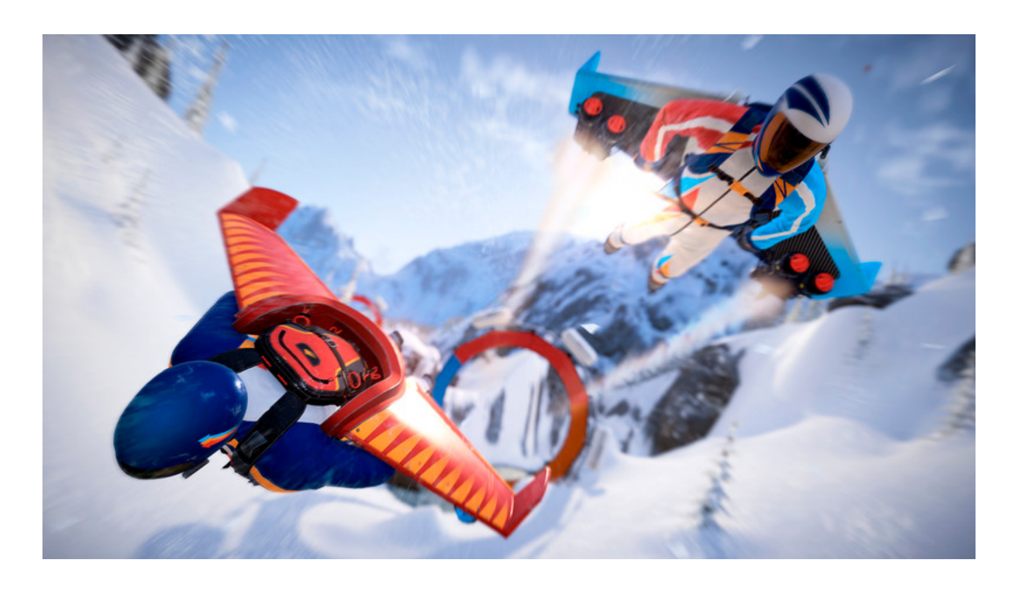
Steep - X-Games Pass Download Mega

Download >>> <a href="http://bit.ly/2SQM3Wk">http://bit.ly/2SQM3Wk">http://bit.ly/2SQM3Wk</a>